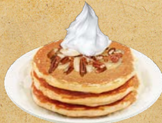
BANANA & PECAN Topped with Whipped Cream 14.95