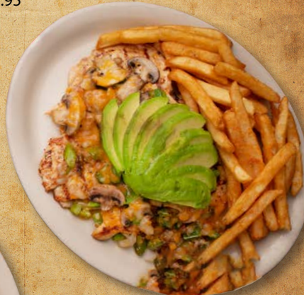
Mushroom Chicken Chicken Breast with Mushrooms, Bell Pepper, Onion, Avocado & Melted Cheese 19.95