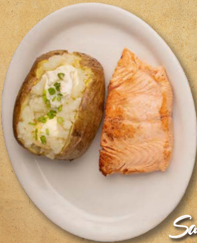
Salmon 19.95 TRY IT HONEY GLAZED 1.00 extra