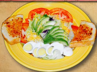
AVOCADO SALAD w/ Boiled Egg 15.95