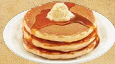
STACK OF PANCAKES (3) 11.95