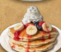
FRESH BERRIES & BANANA Topped with Whipped Cream 15.95