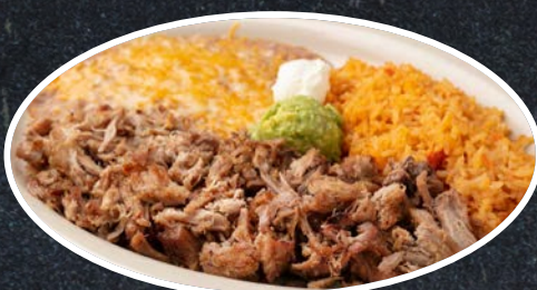
CARNITAS PLATE 18.95 Fried Pork, Guacamole & Sour Cream