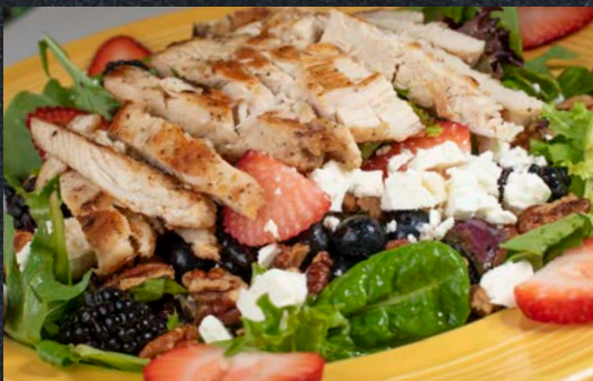
CHICKEN BERRY SALAD Spring Mix Salad with Vinaigrette Dressing Topped with Chicken Breast, Fresh Berries, Sweet Pecan & Feta Cheese 16.95