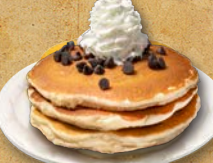
CHOCOLATE CHIP PANCAKES Topped with Whipped Cream 13.95