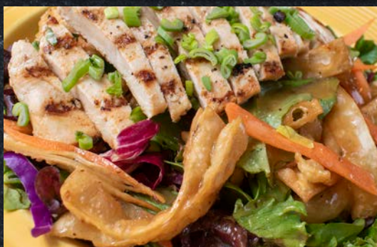
ASIAN CHICKEN SALAD Spring Mix Salad with Sesame Seed Dressing Topped with Grilled Chicken Breast, Wonton Strips & Green Onions 16.95