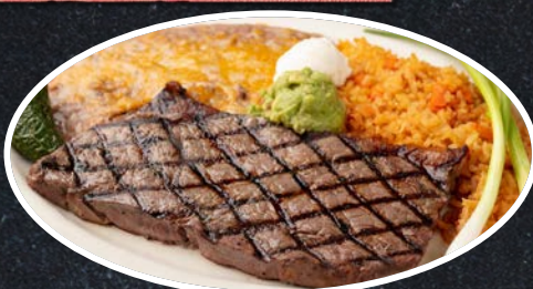
CARNE ASADA PLATE 20.95 Top Sirloin, Guacamole & Sour Cream