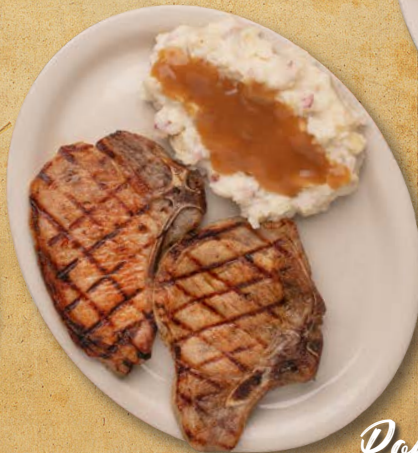
Pork Chops 18.95