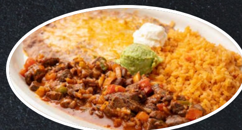
STEAK PICADO 18.95 Chopped Steak with Jalapeños, Onions, Tomatoes & Spices sautéed in tasty sauce with Guacamole & Sour Cream