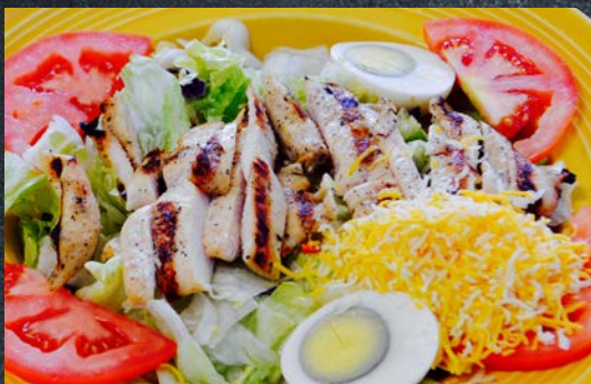
GRILLED CHICKEN SALAD Grilled Chicken, Tomatoes, Hard Boiled Egg & Cheese 15.95

TRY tossed in BUFFALO SAUCE or BBQ SAUCE 1.00 extra