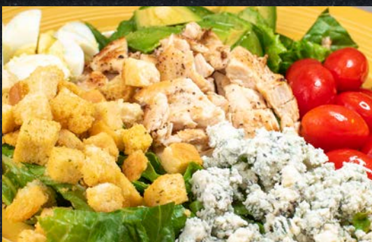
COBB SALAD with Chicken Breast, Avocado, Egg, Tomato, Bacon, Croutons & Bleu Cheese Crumbles 16.95