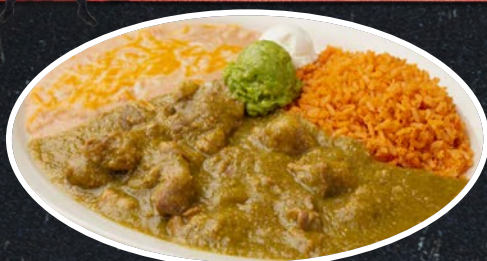
CHILE VERDE 17.95 Chunks of Lean Pork Cooked in Green Chile with Guacamole & Sour Cream