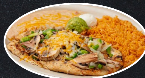
HONGOS CHICKEN 18.95 Two Chicken Breasts with Mushrooms, Bell Peppers, Onions, Melted Cheese with Guacamole & Sour Cream