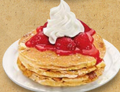
SWEET CREAM CHEESE & STRAWBERRY Topped with Whipped Cream 14.95