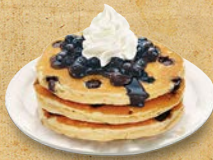
BLUEBERRY PANCAKES Topped with Whipped Cream 13.95