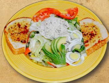
TUNA SALAD w/ Avocado & Boiled Egg 15.95