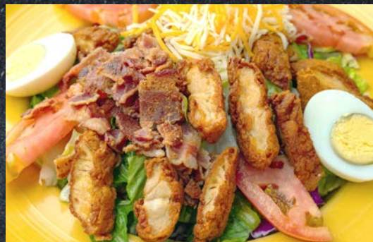
CRISPY CHICKEN SALAD with chicken tenders, tomatoes, bacon Hard Boiled Egg & Cheese 16.95

TRY tossed in BUFFALO SAUCE or BBQ SAUCE 1.00 extra