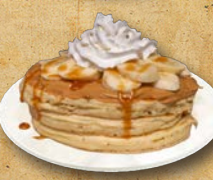
NUTELLA & BANANA PANCAKES Topped with Whipped Cream 14.95