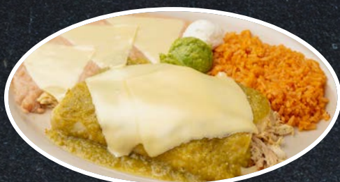
TWO ENCHILADAS SUIZAS 16.95 (Chicken or Beef) Green Sauce, Swiss Cheese, with Guacamole & Sour Cream