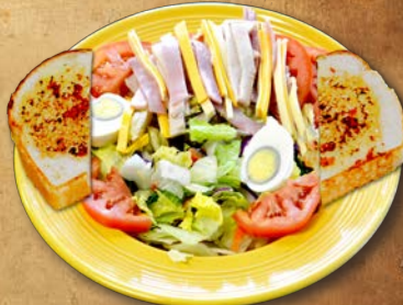
CHEF SALAD Turkey, Ham, Tomato, Hard Boiled Egg & Cheese 15.95

Hot Bread Upon Request We Cut Our Salads Fresh Daily