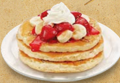
STRAWBERRY & BANANA Topped with Whipped Cream 15.95