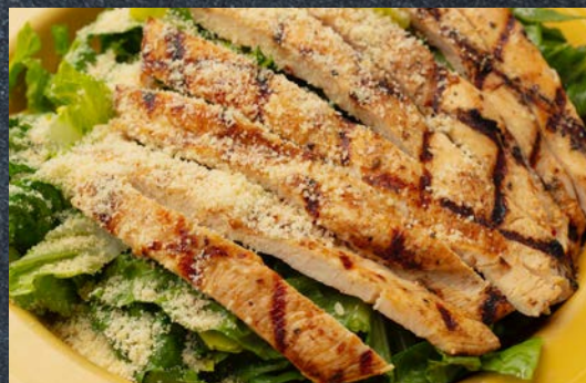
CAESAR SALAD Romaine Lettuce with Caesar Dressing & Parmesan Cheese with Choice of Steak or Chicken Breast 16.95 *No Meat Option 13.95 *Substitute Salmon 3.95 extra (Croutons Upon Request)